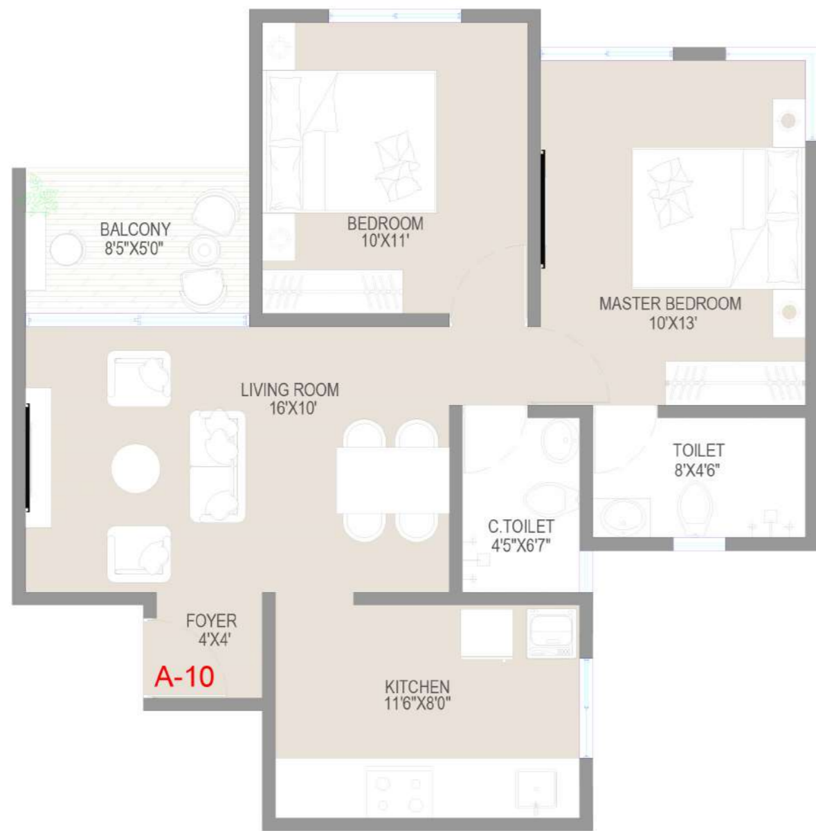
Carpet area - 664.35 sqft