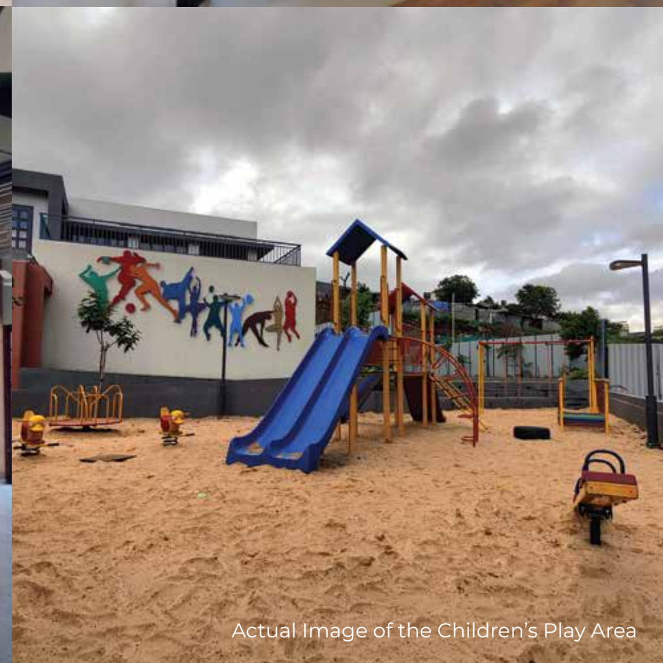
Actual Image of the Children's Play Area