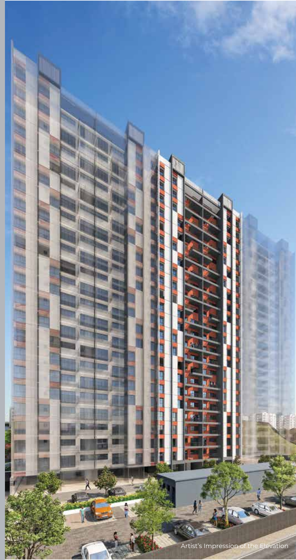
Artist's Impression of the Elevation