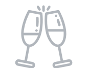
Outdoor Party Lawn