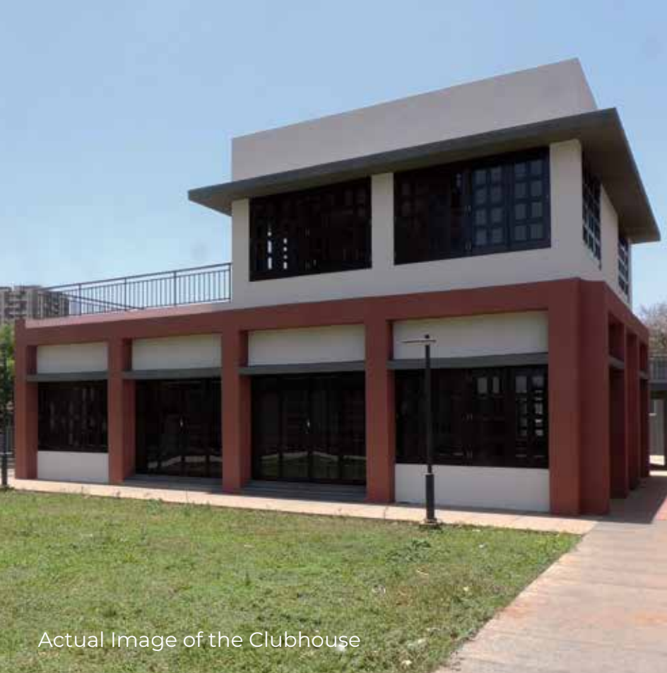
Actual Image of the Clubhouse