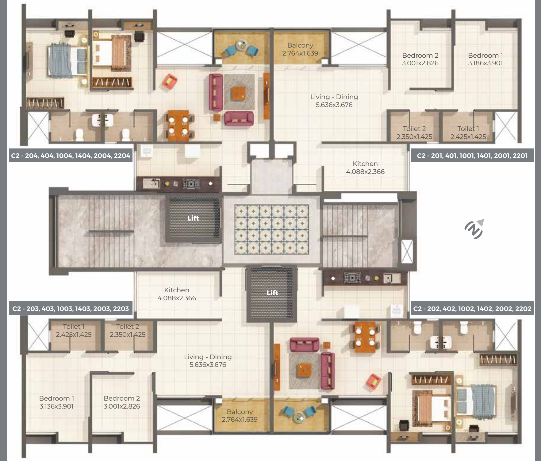
Building C2 - 2nd, 4th, 10th, 14th, 20th & 22nd Floor Plan