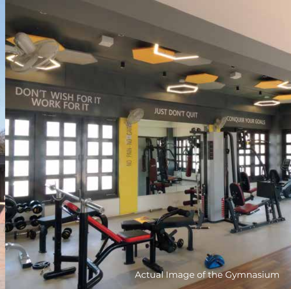
Actual Image of the Gymnasium