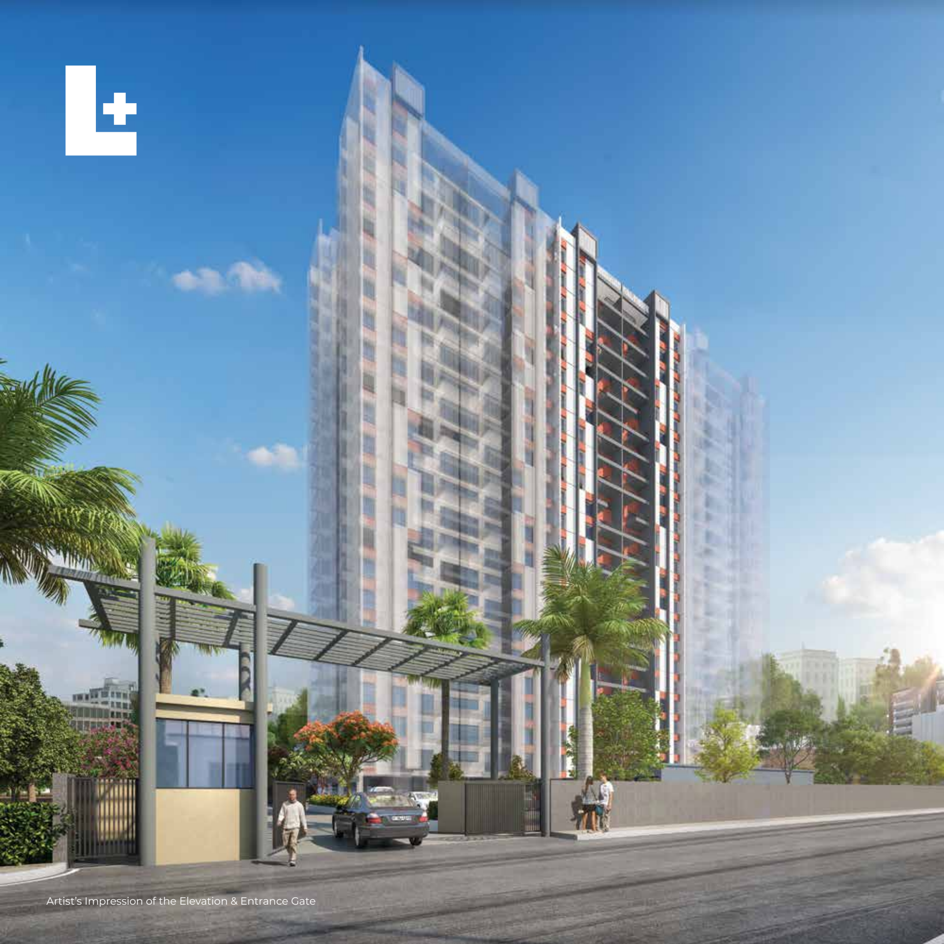
Artist's Impression of the Elevation & Entrance Gate

The 22 storeyed new tower boasts of Large 2BHKs, Lush green views, Location benefits and Lavish amenities to give you the complete L+ advantage.