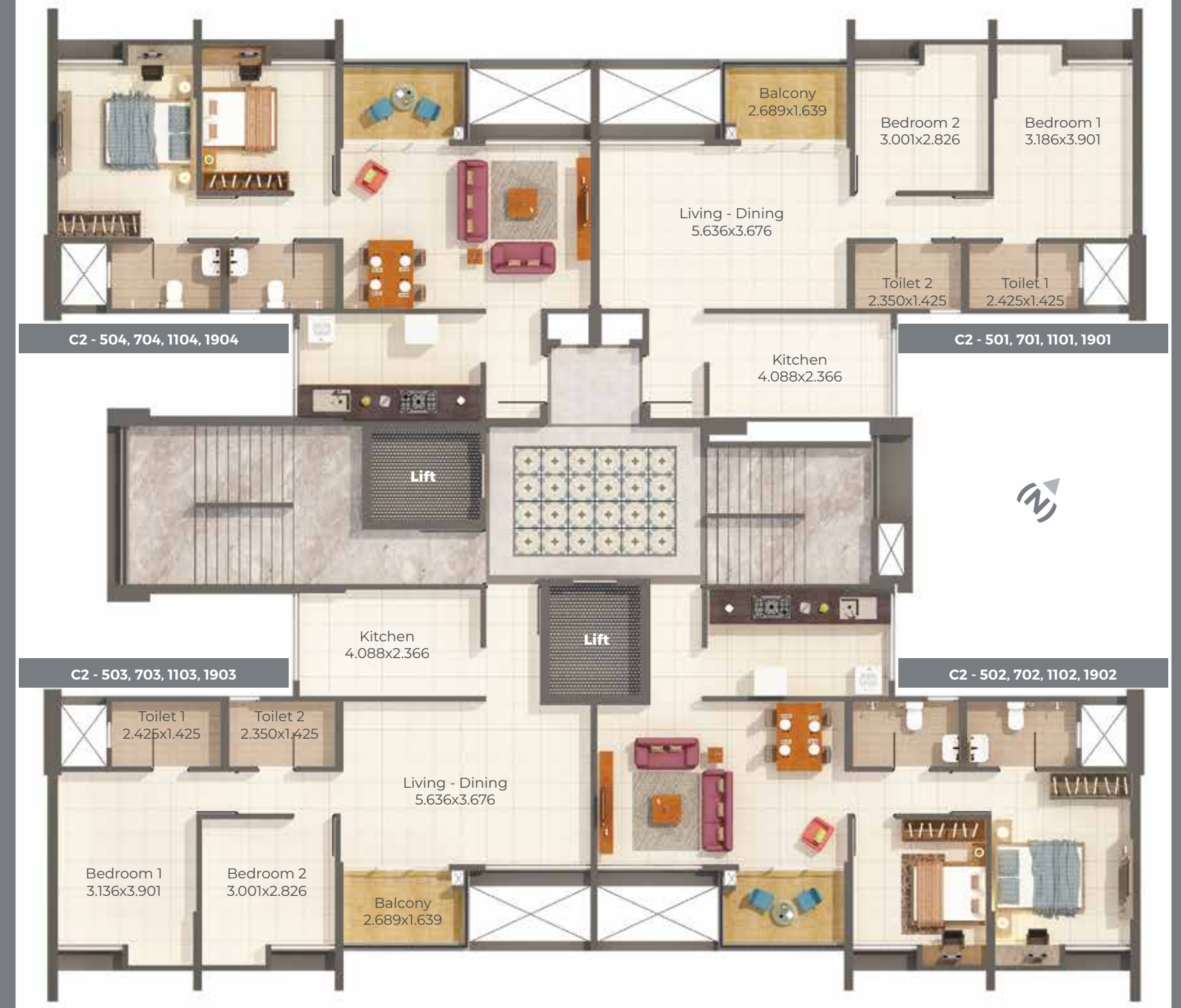
Building C2 - 5th, 7th, 11th & 19th Floor Plan