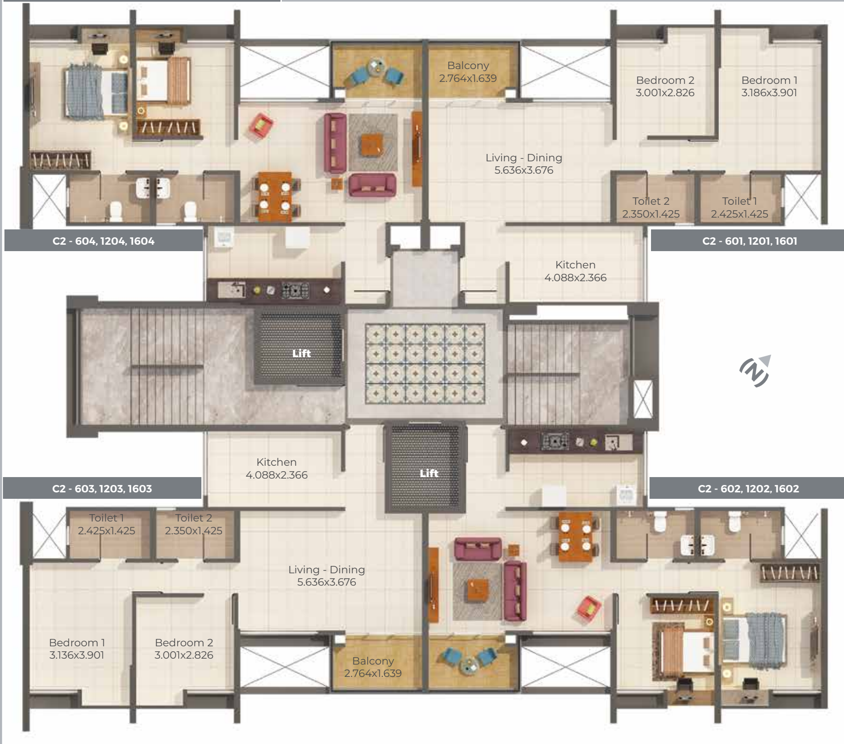
Building C2 - 6th, 12th & 16th Floor Plan