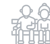
Sr. Citizen Sitout