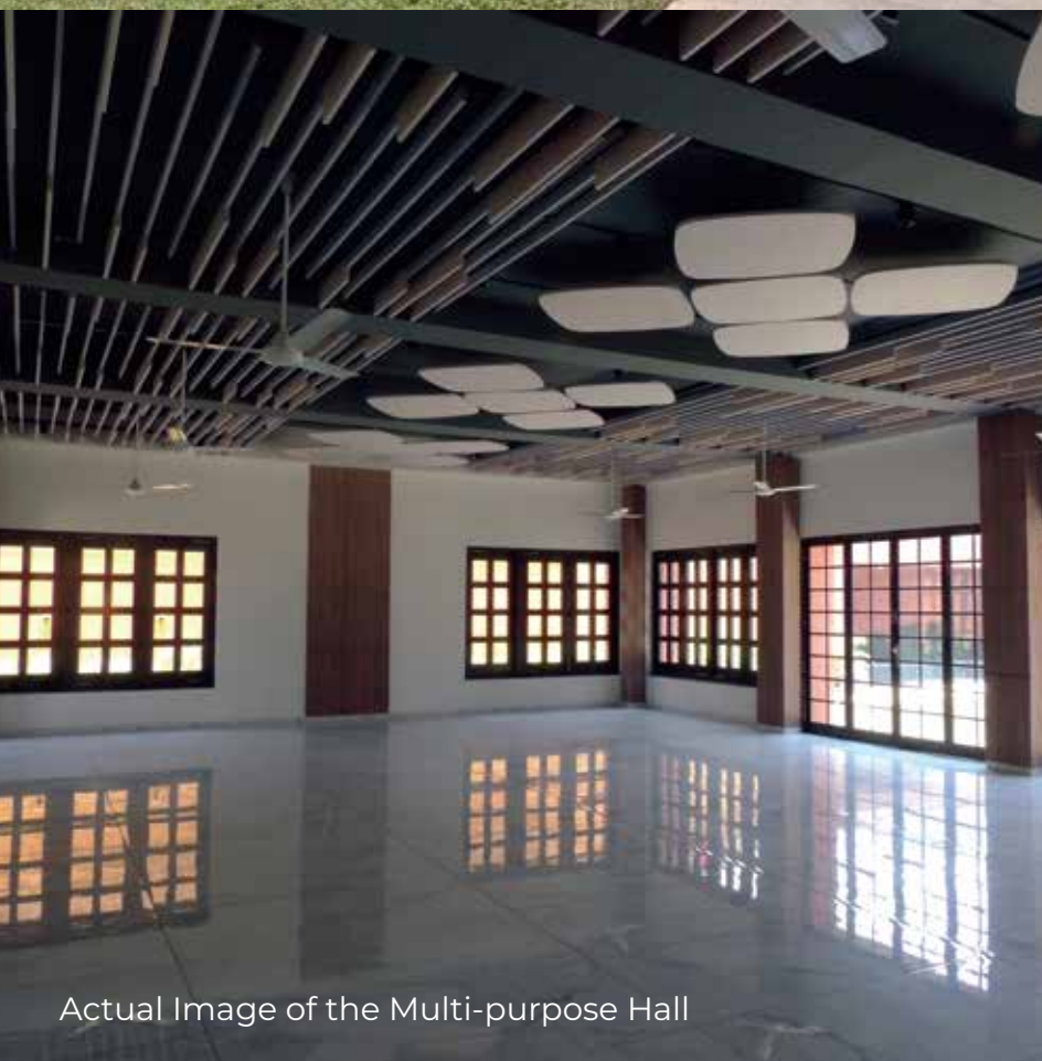
Actual Image of the Multi-purpose Hall