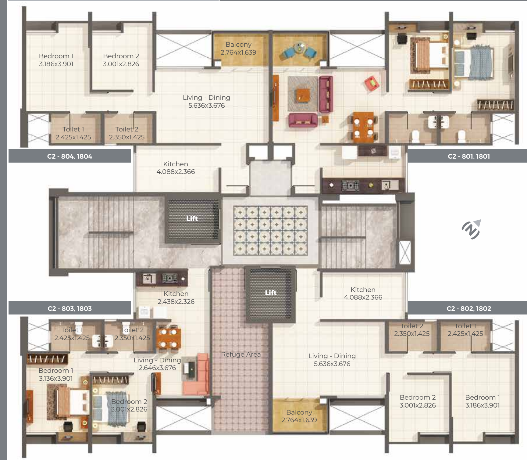
Building C2 - 8th & 18th Floor Plan (Refuge Floor)