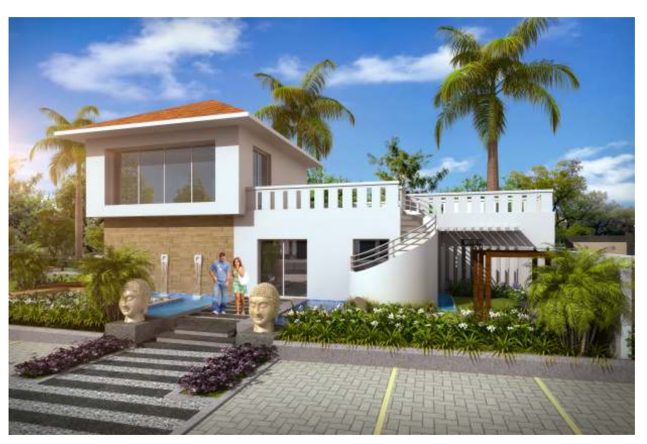
TIMELESS LANDSCAPE AND ULTIMATE COMFORT