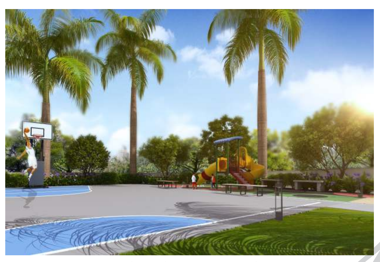
A WORLD OF INFINITE DELIGHT