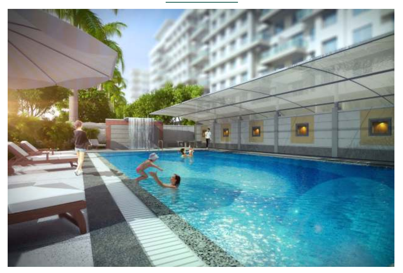
DIVE INTO RELAXATION AND TRANQUILITY