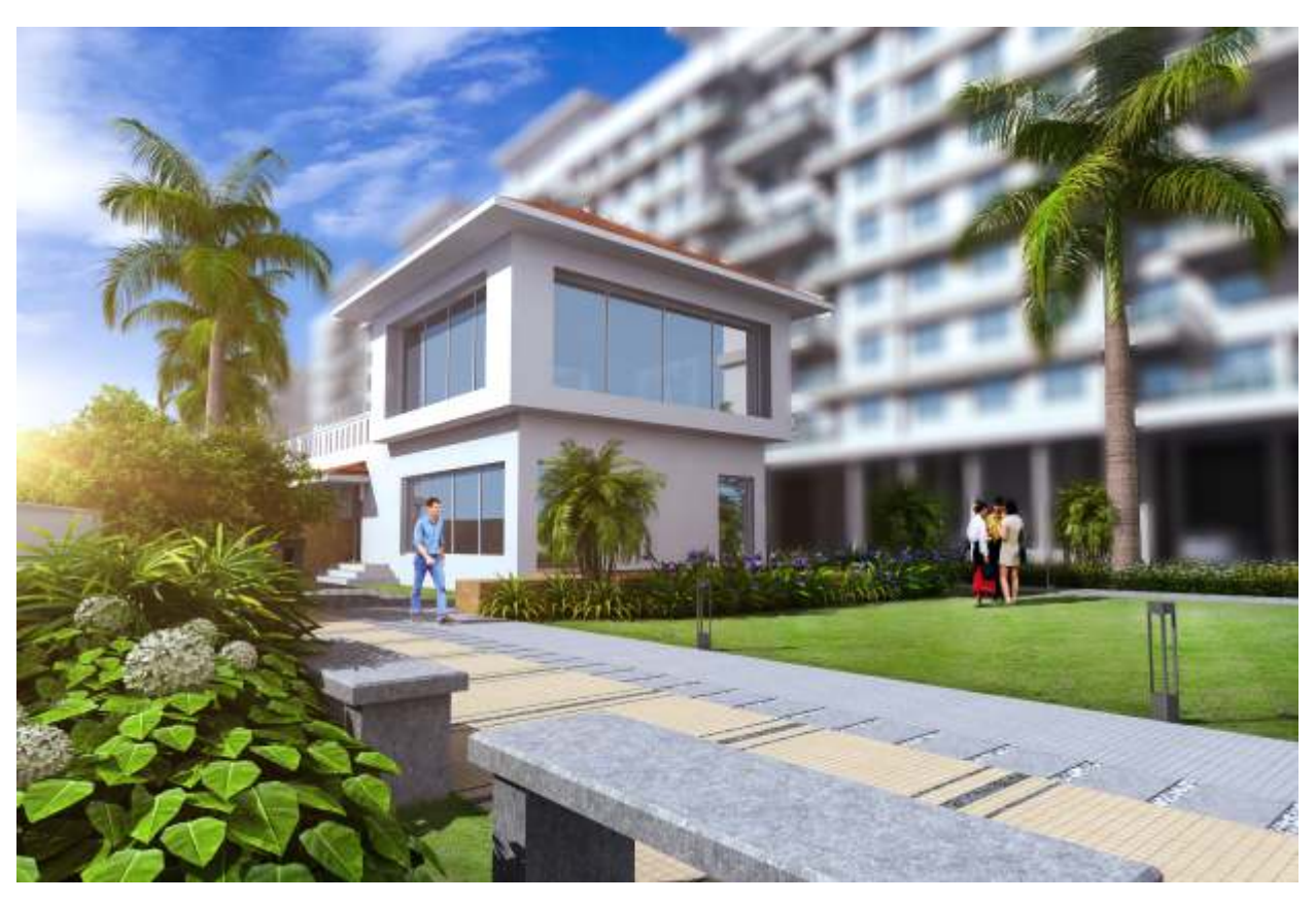
RECHARGE AND RECONNECT WITH FAMILY AND FRIENDS